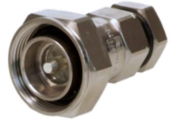
OMNI FIT™ Premium Connectors